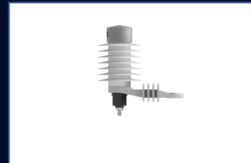
Fig. 3 Arrester w/out mounting brkt.