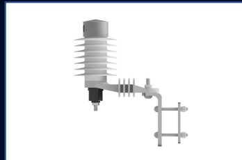
Fig. 1 Cross-arm mount config.